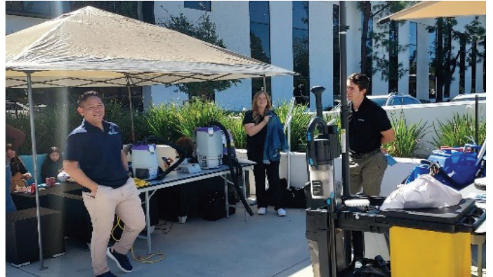
The Los Angeles team had a beautiful day for its FBO Appreciation Day.