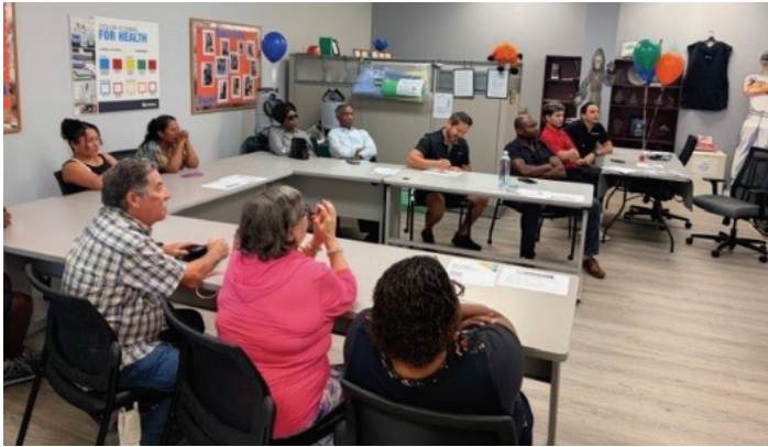
Fort Myers hosted many Franchise Owners for learning and connecting.

Our Support Centers were bustling with Franchise Business Owners for our Appreciation Days. Owners took part in training and learning events. They also shared best practices with their fellow Owners on how they can continue to drive their business forward.