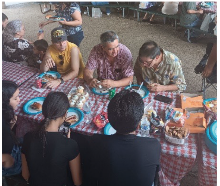
Franchise Owners in Madison were able to connect and share ideas regarding their independent businesses.