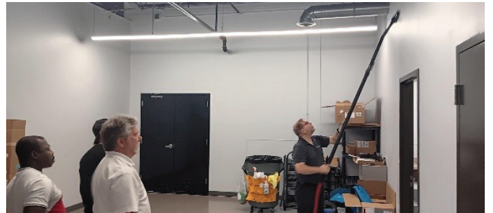
Training was front and center during the FBO Appreciation Day in Twin Cities.