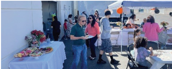
Las Vegas had a great turnout for their FBO Appreciation Day event.