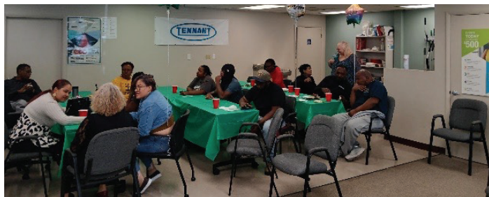
Owners in Virginia Beach gathered to connect with the Center team and other Owners.